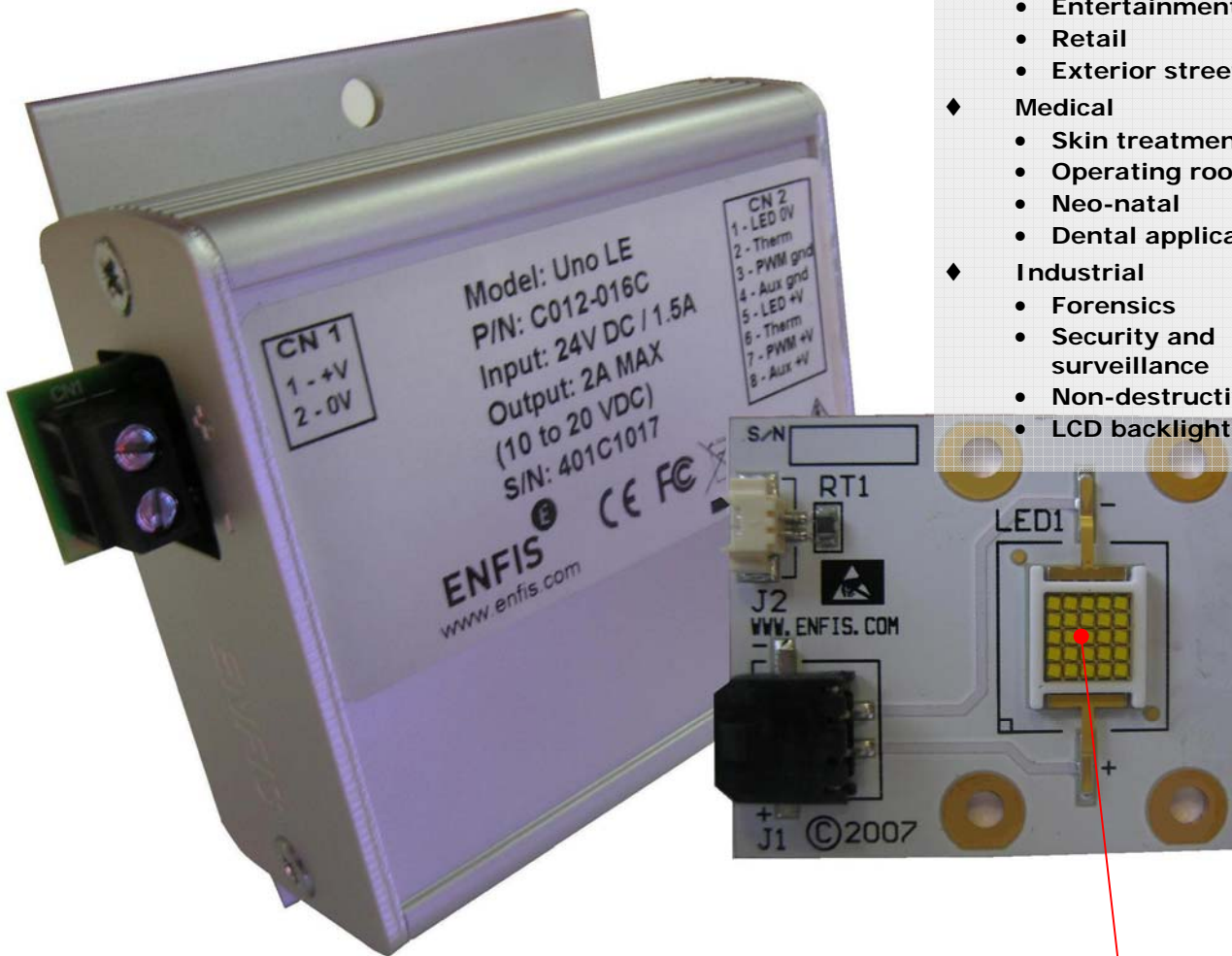
The 0.5cm 2 Array 25 high-power LEDs